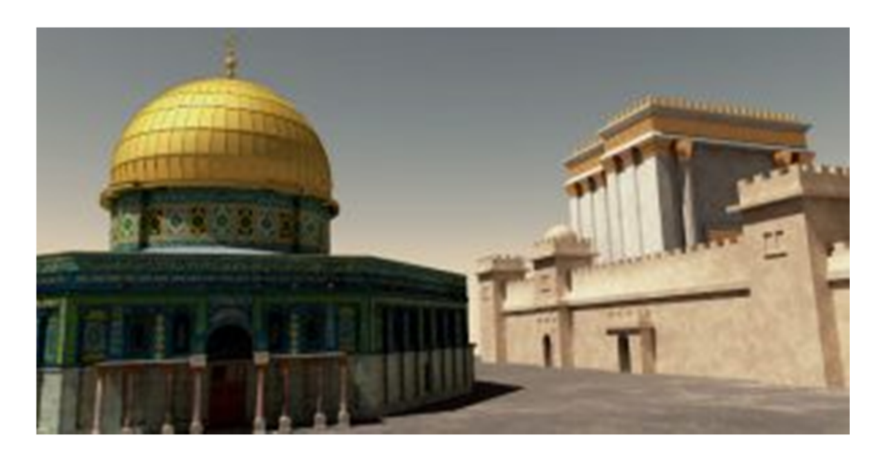
Rev 11:1-3 And there was given me a reed like unto a rod: and the angel stood, saying, Rise, and measure the temple of God, and the altar, and them that worship therein.

But the court which is without the temple leave out, and measure it not; for it is given unto the Gentiles: and the holy city shall they tread under foot forty and two months. And I will give power unto my two witnesses, and they shall prophesy a thousand two hundred and threescore days, clothed in sackcloth. 1 290 Days