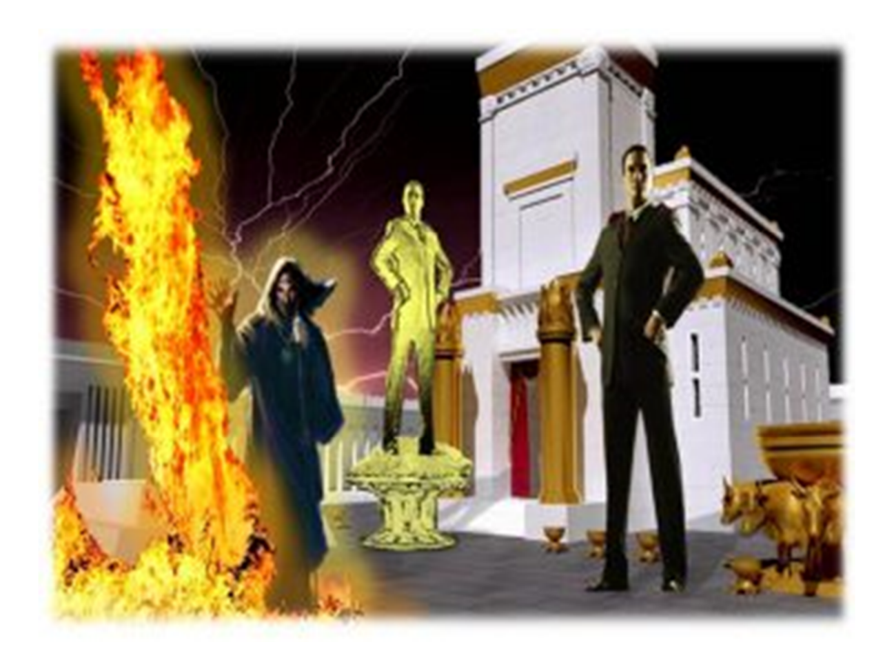
Dan 12:11-12 And from the time that the daily sacrifice shall be taken away, and the abomination that maketh desolate set up, there shall be a thousand two hundred and ninety days. 1 290 days

Blessed is he that waiteth, and cometh to the thousand three hundred and five and thirty days. 1 335 Days