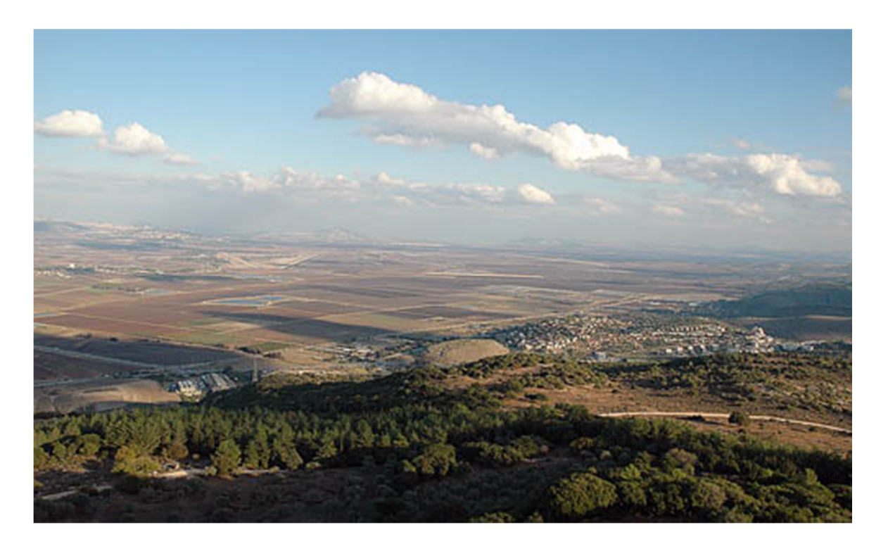
Megiddo and Jezreel Valley, Israel